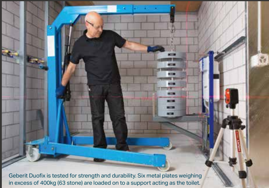
Geberit Duofix is tested for strength and durability. Six metal plates weighing in excess of 400kg (63 stone) are loaded on to a support acting as the toilet.