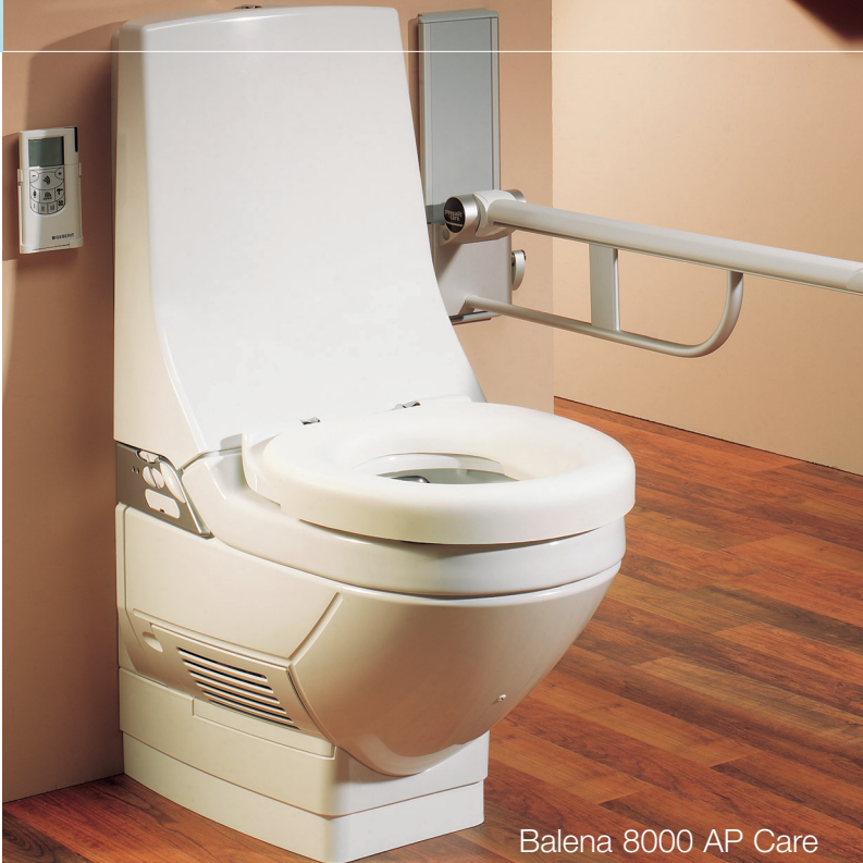
Balena 8000 AP Care

The Balena 8000 AP Care shower toilet complies with the requirements of the UK Water Supply Regulations